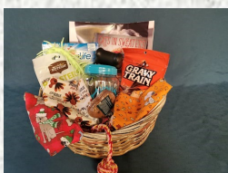
Puppy Pleaser basket sold for $60.