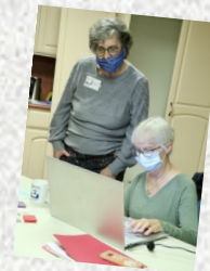
Tallying the scores