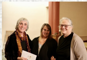
The prize winners