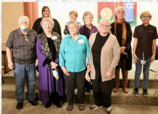
The amazing Storytellers